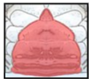
Mature Female "Sook"