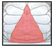
Immature Female "Sally" or "She-Crab"